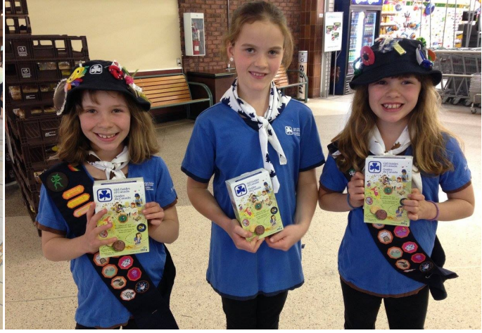
Read more about cookies on page 7 and more stories on 13-15.